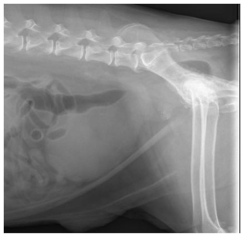
<u><b>Right Lateral Caudal Abdomen </u>