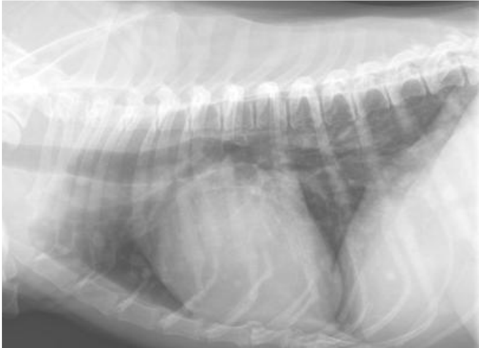
Figure 2: Right Lateral