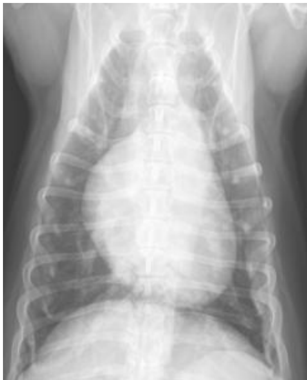
Figure 1: Ventrodorsal