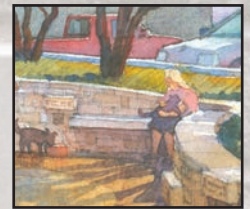
Stone bench 3 remaining $10,000