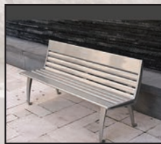
Backed Bench 3 remaining $2,500