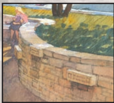
Enhanced Limestone 25 remaining $3,500