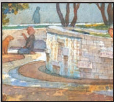
Cascading Water Feature $50,000