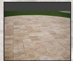
Engraved Pavers 49 remaining $1,000

Track progress at www.vet.ksu.edu/depts/VHC/plaza.htm .