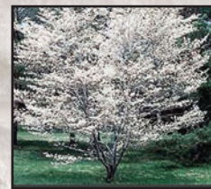
Flowering Tree 8 remaining $1,500