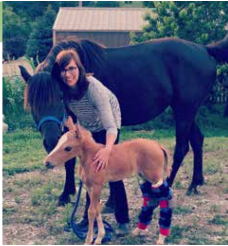
Baby Horse wore her leg braces to help keep pressure off of her joints while they were still forming.